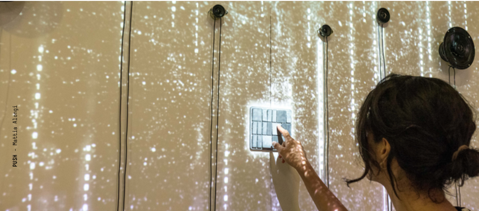
PUSH - Mattia Alongi