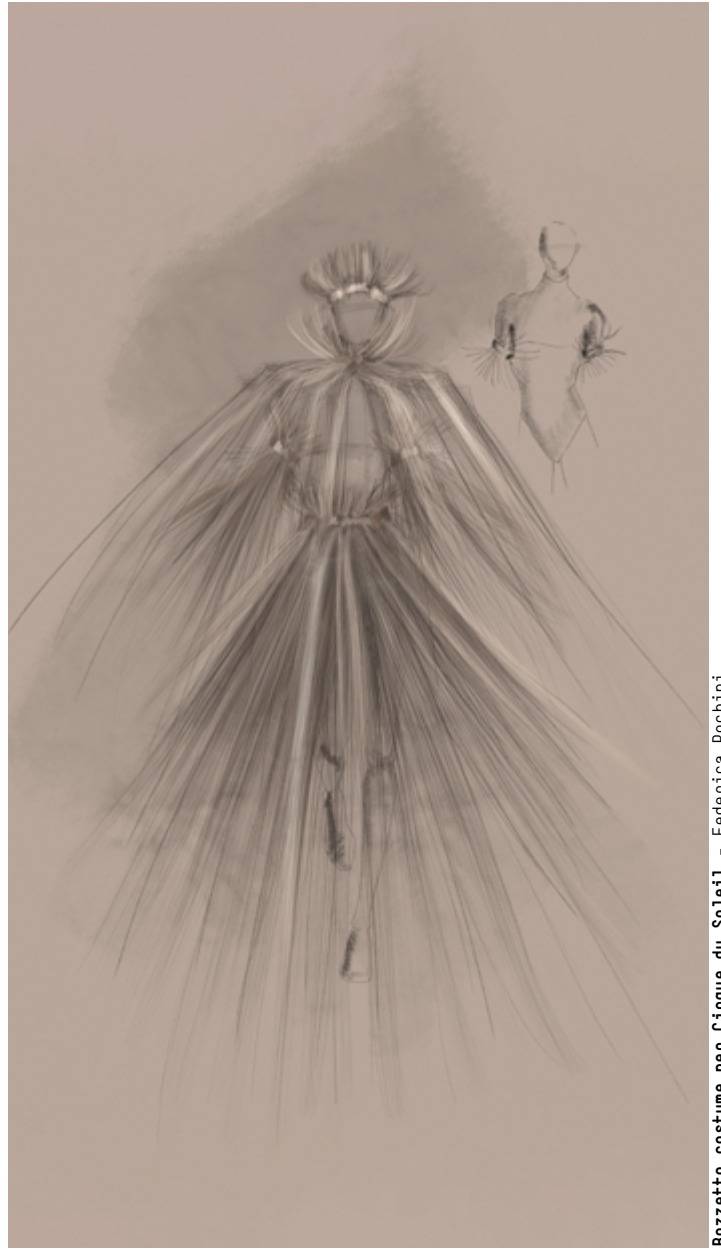
Bozzetto costume per Cirque du Soleil - Federica Pochini